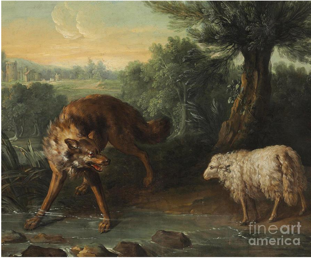
The Wolf and the Lamb By Jean Baptiste Oudry

Christian Worship for July 11th 2021 Trinity 7