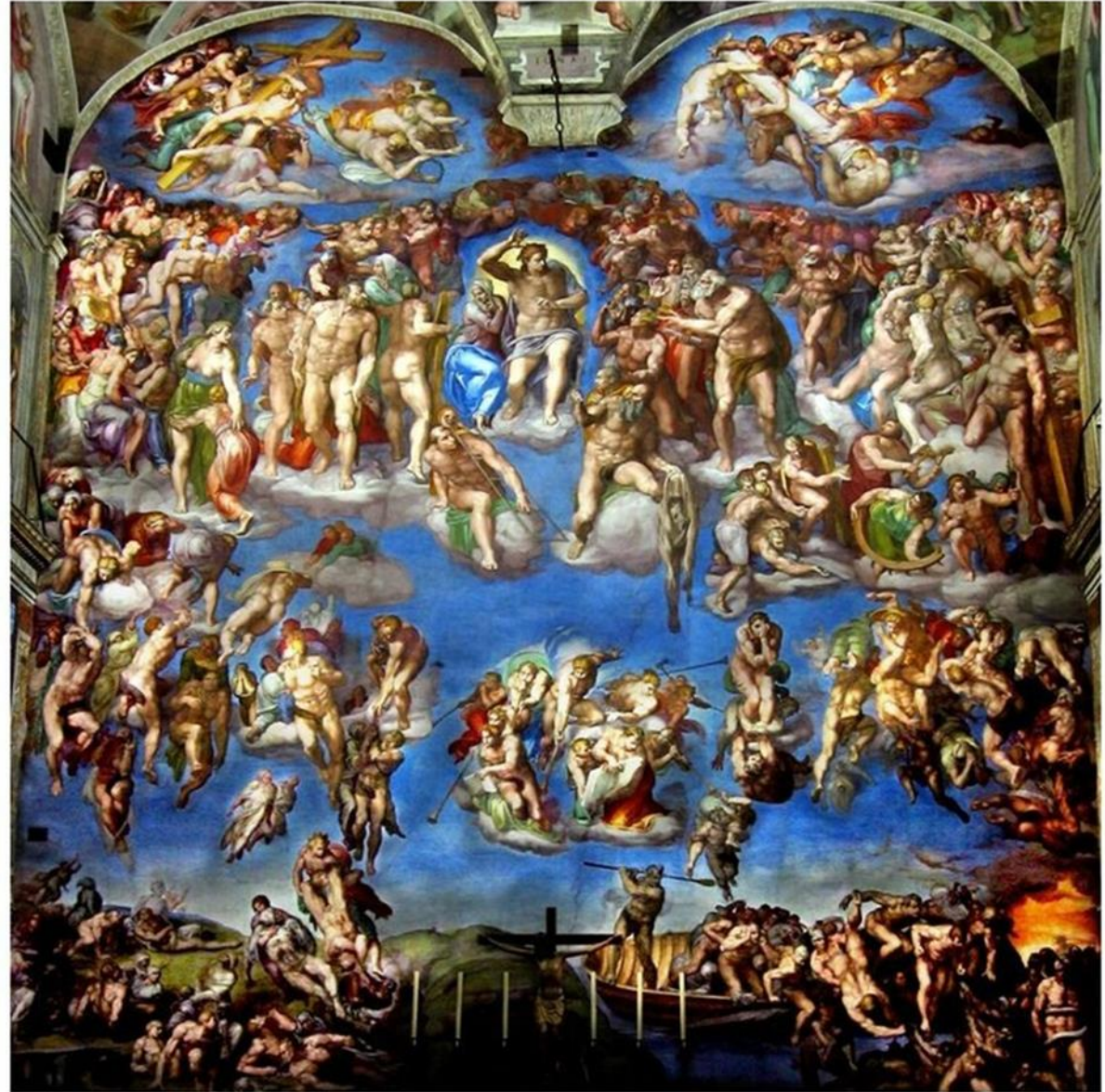
“The Last Judgment” by Michael Angelo