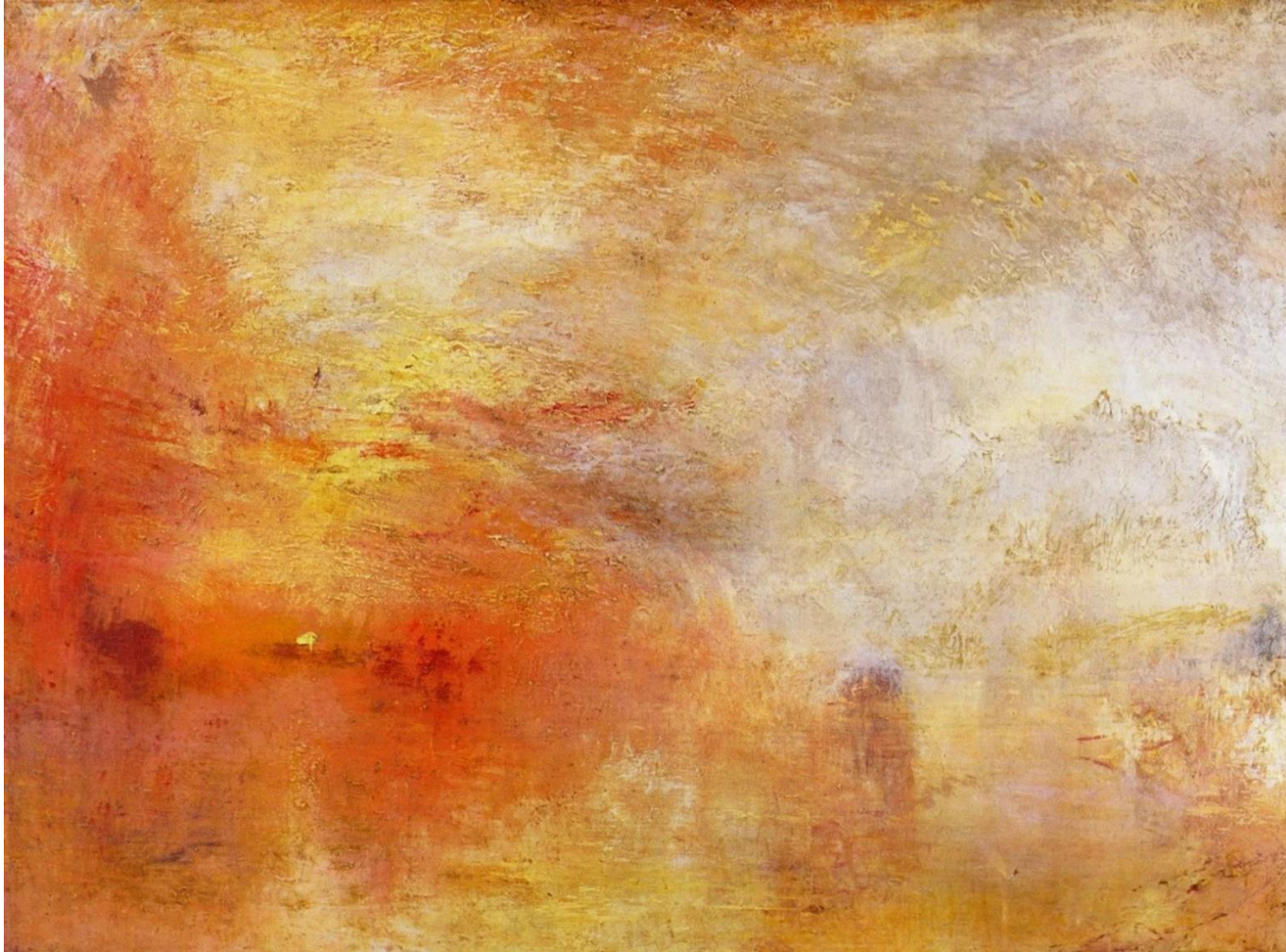
“Sun setting over a lake” by Joseph Turner